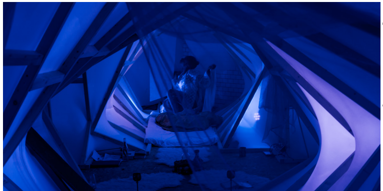
the I of Sisters Academy fra The Boarding School